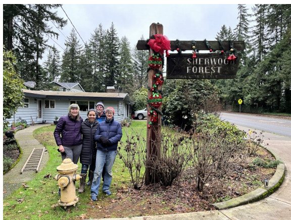
Sherwood Forest sign decoration